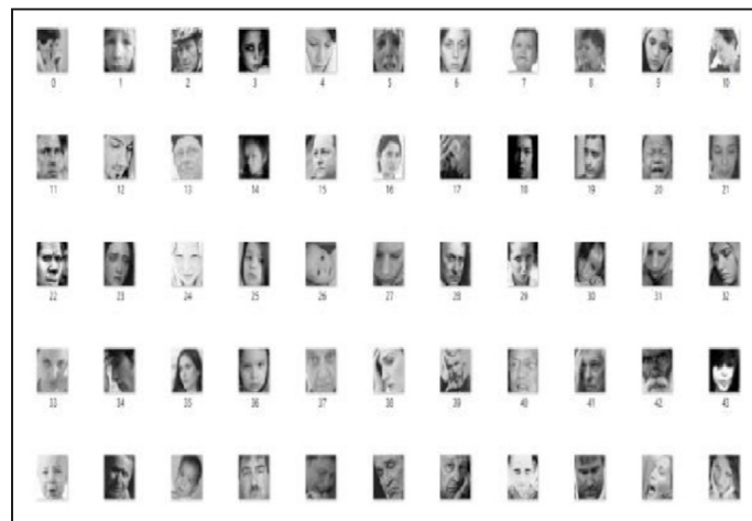
Fig: Images showing emotion sad

For training the model I used Kaggle Fer-2013 which is an open source dataset that has a total of 33,887 grayscale images classified into classes of emotions like: