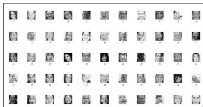
Fig: Images showing emotion happy